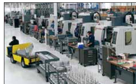
CNC machining centers