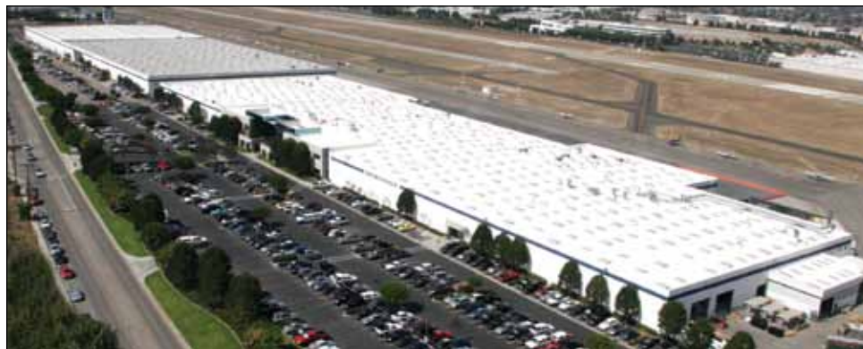
Robinson's 617,000 square foot facility.

To maximize efficiency and productivity, a large percentage of parts are manufactured in-house allowing the company to better control costs, eliminate delays and ensure the best possible quality.