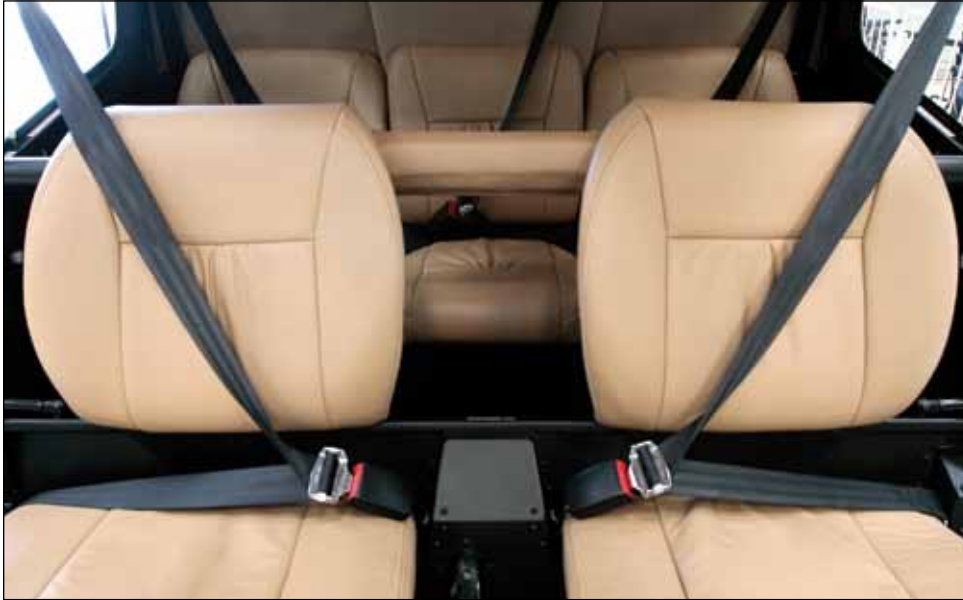
Open cabin design comfortably seats five adults.

TRI-HINGE ROTOR DESIGN eliminates lag hinges, dampers, and hydraulic struts. Blades resist corrosion and have thick leading edges to minimize erosion.