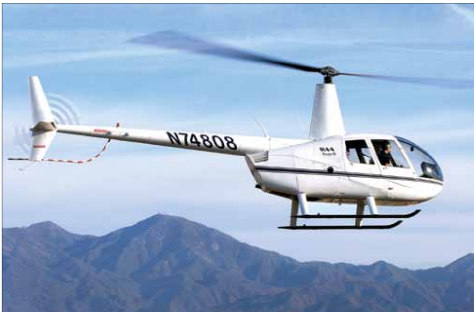
R44 Raven II delivers increased altitude performance.

The high-performance R44 Raven II has a Lycoming IO-540 fuel injected, angle-valve, tuned-induction engine, which eliminates the need for carburetor heat. The standard 28-volt electrical system ensures good starting performance in hot or cold weather and provides additional electrical power for optional equipment.