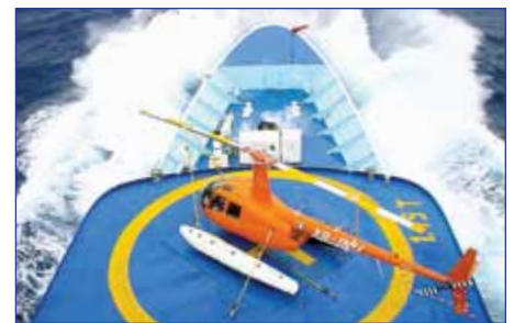
R44 Clipper I shown shipboard with optional rotor blade supports and frame tie-down lugs.