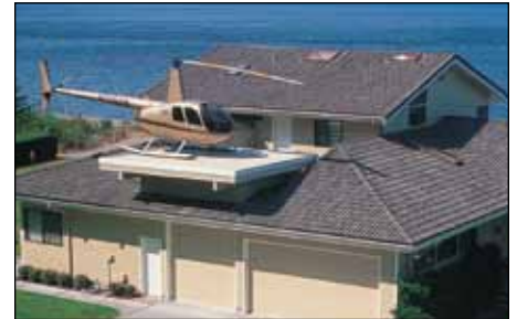
R44 Clipper II, with pop-out floats stowed, on a residential rooftop helipad.

Available only on the Clipper II, pop-out floats have the same buoyancy as fixed-utility floats. The compact, low profile design minimizes the floats' impact on the helicopter's cruise speed and makes it easy to get in and out of the helicopter. Pop-out floats add 65 pounds to the helicopter's empty weight and, when not inflated, stow in snug sleeves along the skid tubes. A trigger on the collective deploys the floats, which inflate from a compressed helium-filled, carbon-fiber tank located under the left front seat.