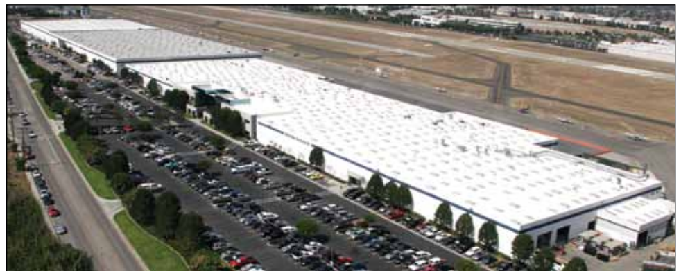
Robinson's 617,000 square foot facility.

To maximize efficiency and productivity, a large percentage of parts are manufactured in-house allowing the company to better control costs, eliminate delays and ensure the best possible quality.