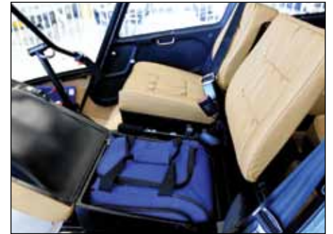
Under-seat storage compartment

STORAGE under each seat allows for carry-on bags, briefcases, and personal belongings.