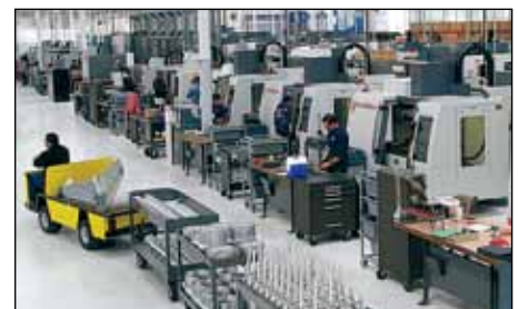
CNC machining centers