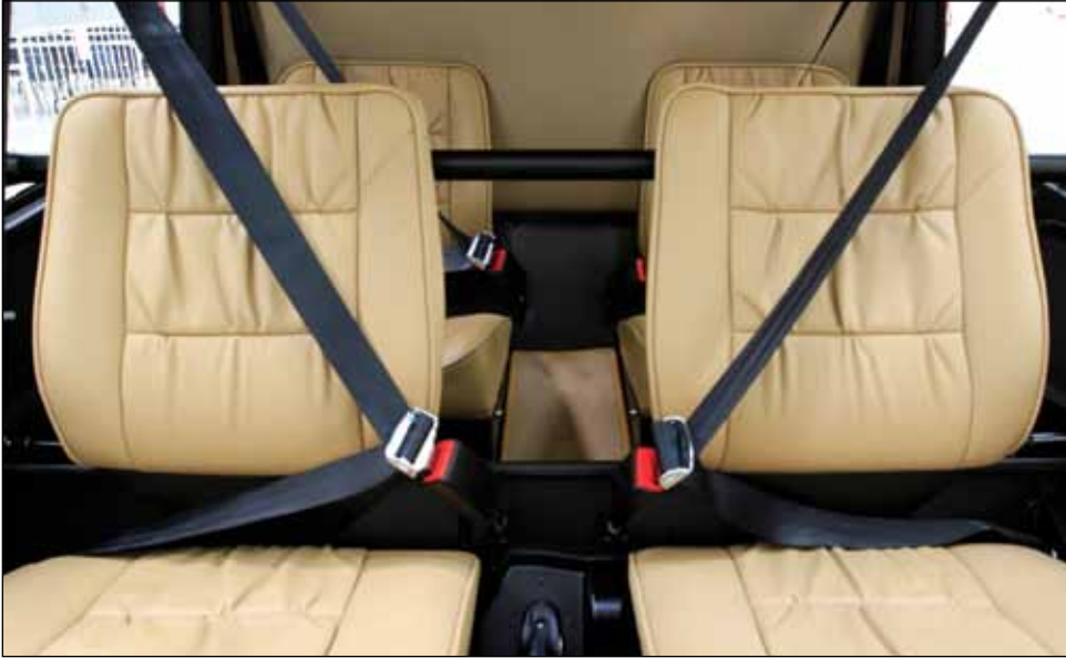
R44 Raven II Interior shown with optional leather seats.

HYDRAULIC POWER CONTROLS eliminate stick shake and control forces, enabling precise hovering and a smoother ride.