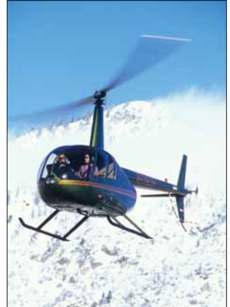
The low operating cost makes the R44 Raven I an excellent flight trainer.